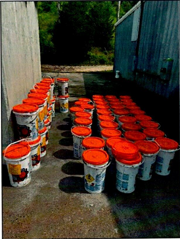
June 5, 2025, at 11:04 am – 56 five-gallon plastic buckets containing slurry.