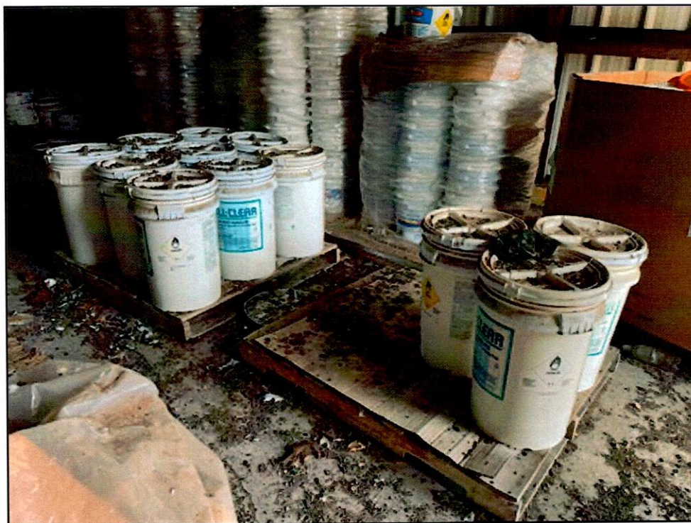
March 17, 2025 – Twelve buckets of hazardous waste, all of which were observed with only an indication of the hazard contained, and with bird droppings and dirt accumulation.