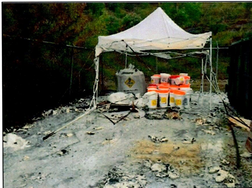
July 28, 2020 – The remaining calcium hypochlorite, after the fire that occurred on July 4, 2020.