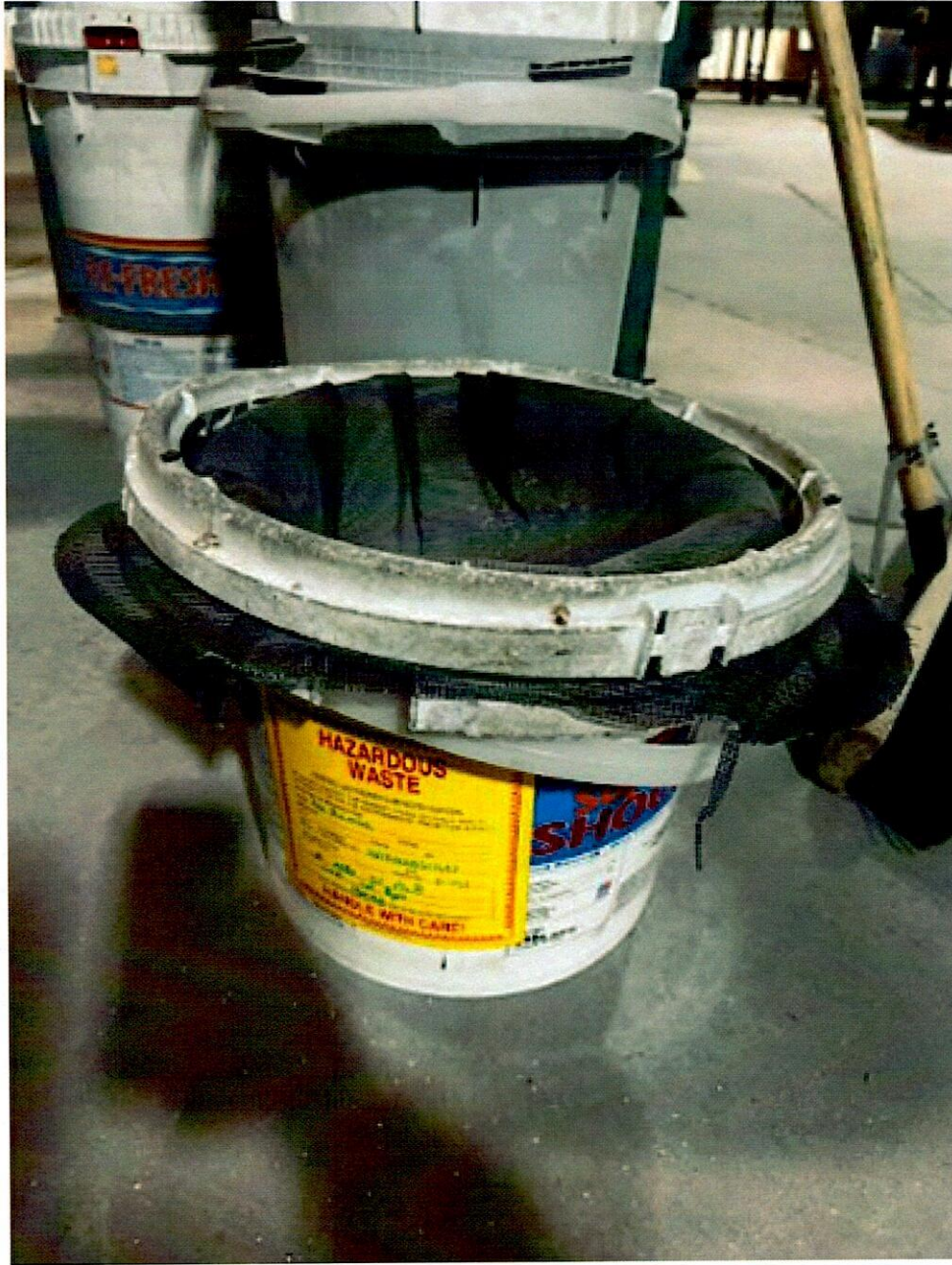
March 17, 2025 – A three-gallon plastic bucket of \text{Ca}(\text{OCl})_2 (calcium hypochlorite) floor sweepings properly labeled, but open.