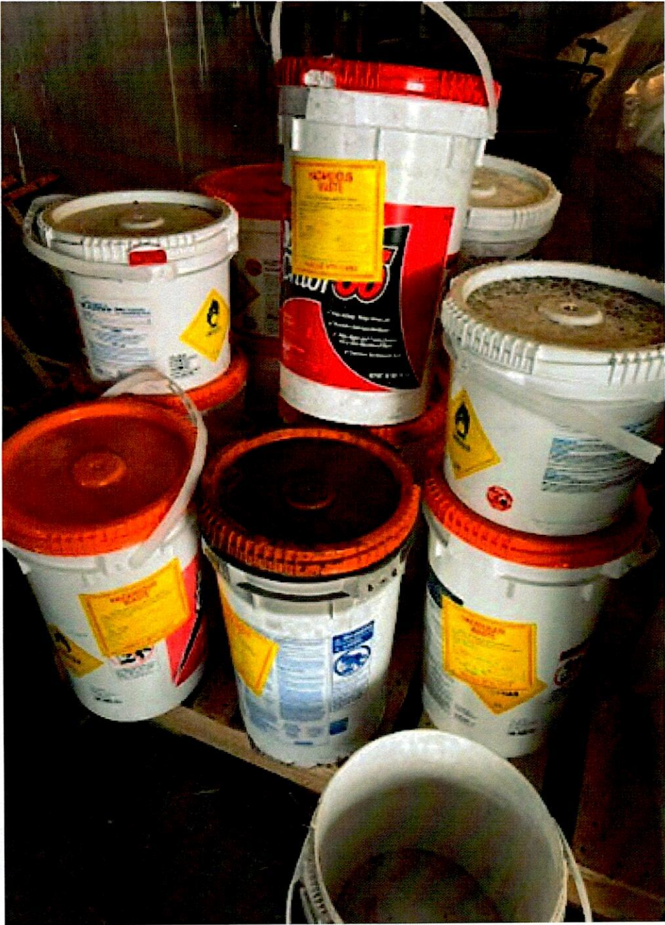
March 17, 2025 – A group of 14 plastic buckets of hazardous waste observed without accumulation dates.