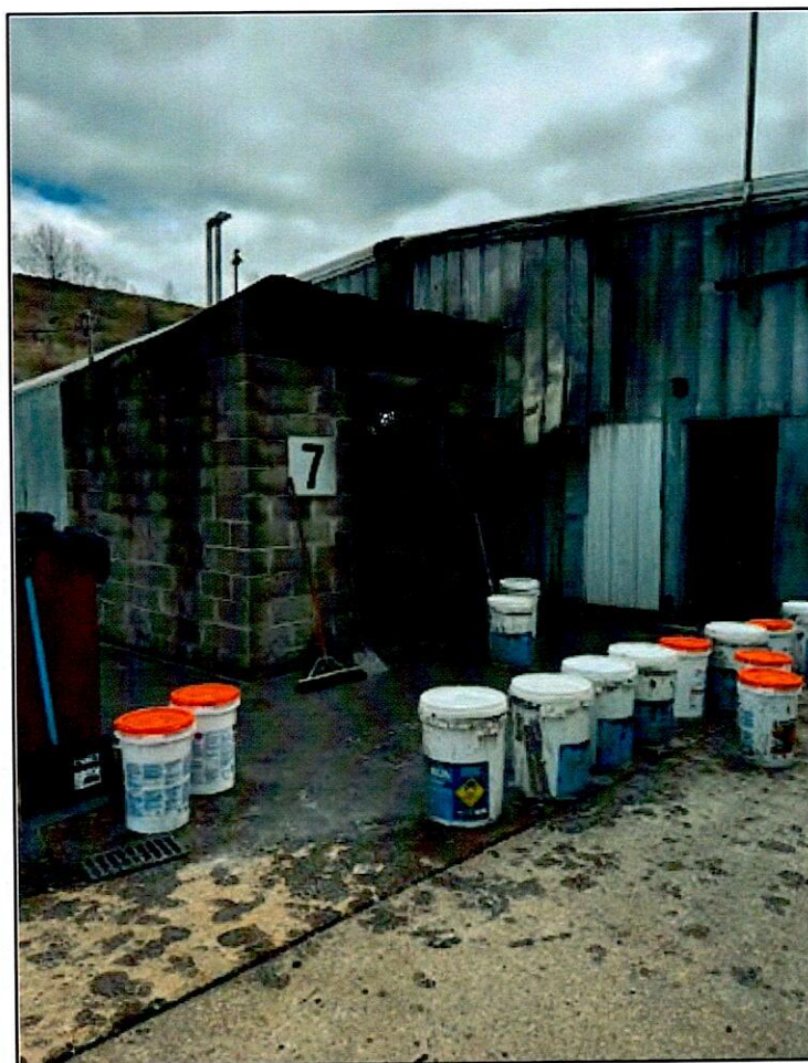
March 17, 2025 – Building 7, the hazardous waste storage building, after the fire (on March 16, 2025).