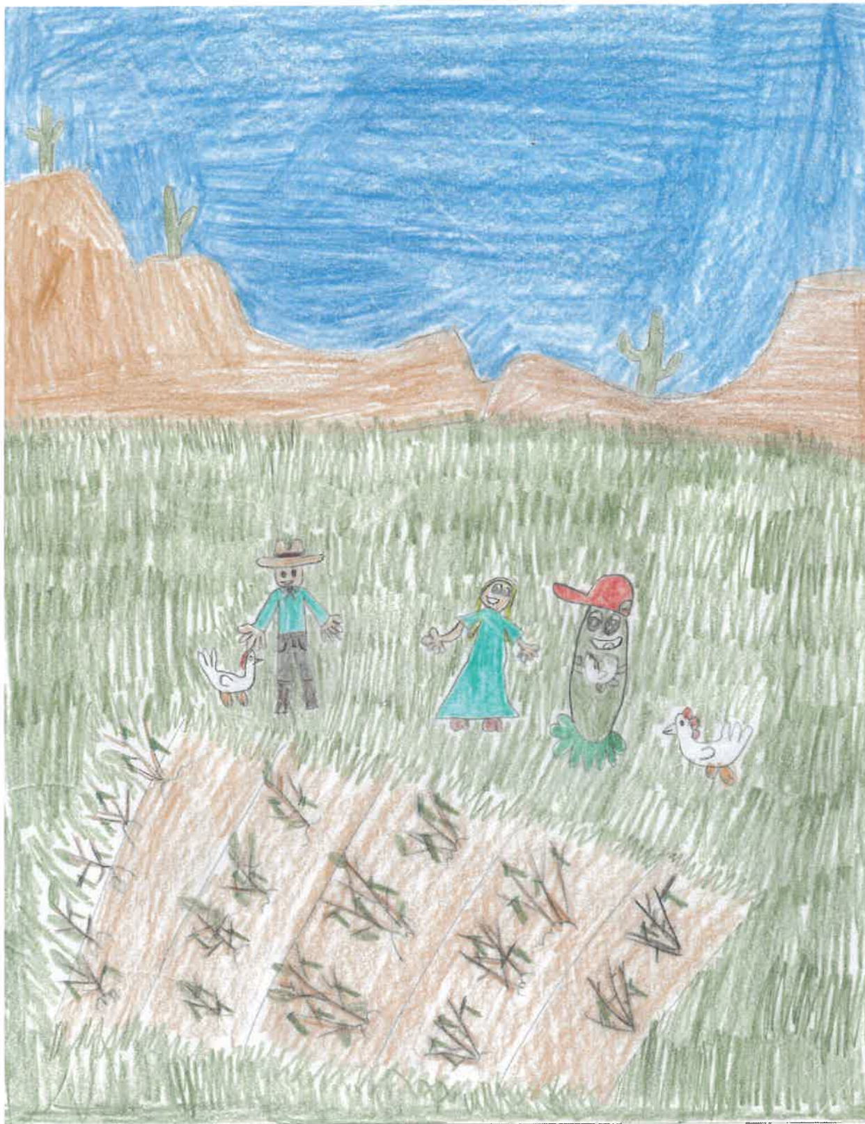
Mary and Pickle Pete landed on a farm in Yucatan, Mexico. They talked to a farmer who grows a lot of jalapeños. The farmer said he really likes to put jalapeños in his food.