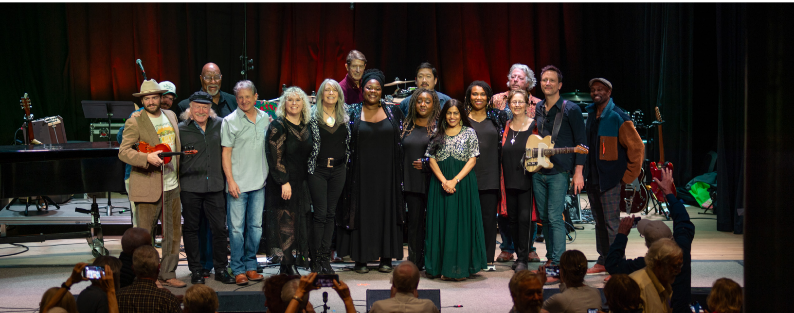
Photo from Mountain Stage performance at Carnegie Hall in Lewisburg, Sunday, October 6, 2024