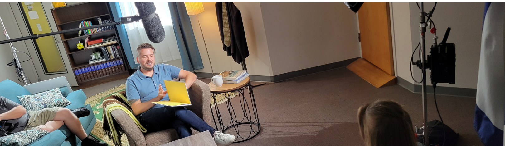
Video shoot for Mountain Readers

West Virginia Public Broadcasting's production departments continue to work on programs throughout the year to elevate the culture of Appalachia. Among productions this year: