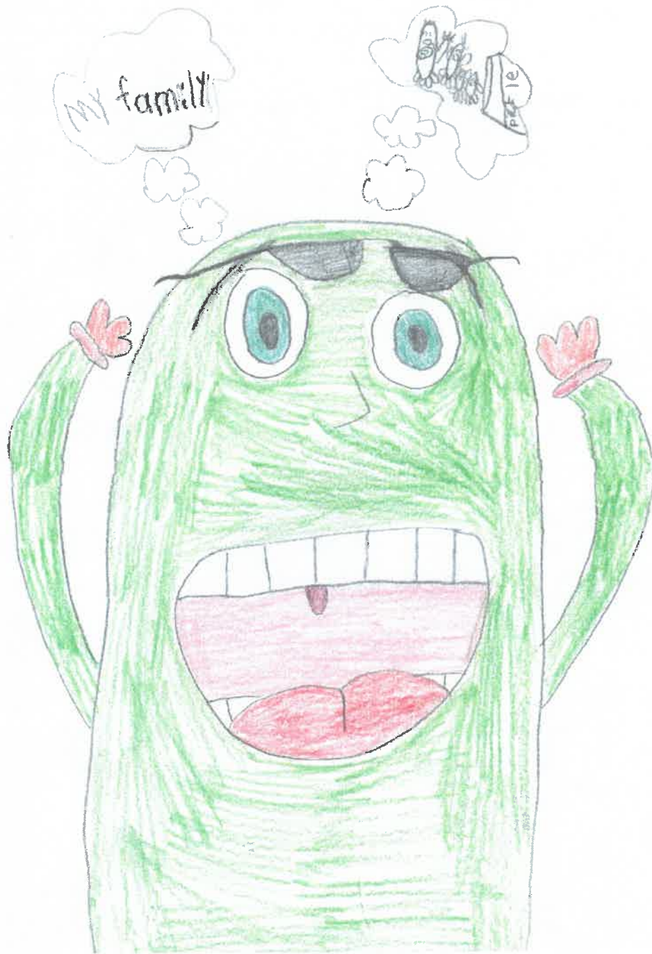
Pickle Pete saw a jar of pickles on the shelf. Pickle Pete was scared because he thought the pickles looked like his family.